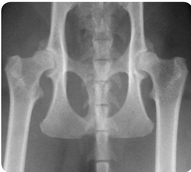
Figure 1. Hip osteoarthritis in an eight-year-old domestic short-haired cat secondary to hip dysplasia. Large bilateral osteophytes are present on the cranial acetabulum.

Veterinarians globally report that decreased agility and reduced mobility are the most common signs reported to them for cats diagnosed with OA ( Table 1 ). Behavioral changes are also common and usually associated with the cats' decreased agility and reluctance to move around. 8,9 Cats presenting with behavioural problems can be easy to miss and is another reason to screen all cats for OA around 7-10 years of age. These findings are in line with published studies on feline OA.