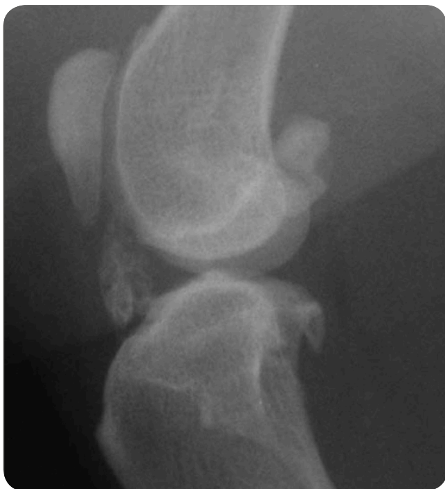
Figure 3. Mineralization of the intra-articular structures in the stifle of a seven-year-old male neutered cat. There is also mild periarticular osteophytosis of the stifle with new bone on the proximal pole of the patella and trochlear ridge.

Although the combination of appropriate clinical signs and physical examination findings may lead you to be fairly certain a cat has OA, it is ideal to try to confirm your suspicions by seeing radiographic changes. The primary radiographic change associated with osteoarthritis is the presence of periarticular osteophyte formation, although this is not always present or easily identifiable in every case. It is important to appreciate that osteoarthritis may be present in the absence of obvious radiographic changes. Contrarily, the presence of radiographic changes does not always correlate with clinical signs of osteoarthritis nor the degree of pain suffered. Occasionally, cats develop excessive periarticular mineralization and ossified bodies adjacent to their joints, particularly in the stifle joint ( Figure 3 ).