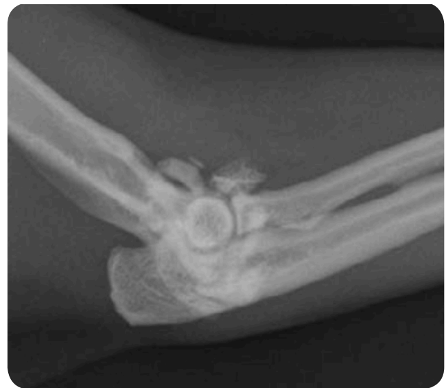
Figure 2. Elbow osteoarthritis in an eleven-year-old Burmese cat. There are periarticular osteophytes and joint mice. Bilateral elbow changes were present.