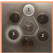
A 1-Weak positive 2-Positive 3-Positive