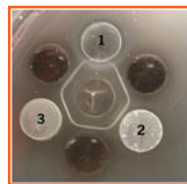
C 1-Positive 2-Positive 3-Positive